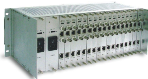
4U, 19 inch, 16 slots Rack