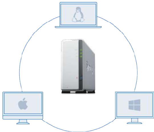
Cross-platform file sharing

Powered by a 2-core processor, DS120j delivers excellent sequential throughput at over 112 MB/s reading and 106 MB/s writing in a Windows® environment 2 . Consuming only 9.81 watts during access and 4.68 watts during HDD hibernation, DS120j is power-efficient and ideal to serve as a 24/7 personal storage server.