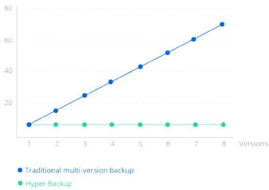
Storage Usage (GB)