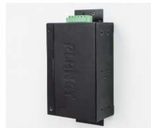
Side Wall Mounting (Space saving)