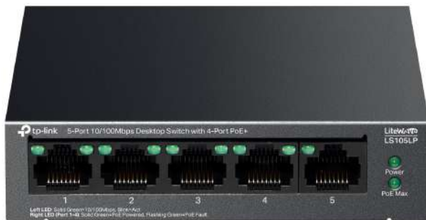
4 × 10/100 Mbps RJ45 ports with PoE+ 1 × 10/100 Mbps RJ45 port