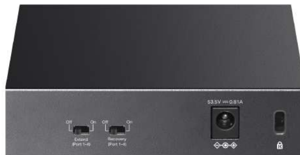
Button for Extend Mode Button for PoE Auto Recovery